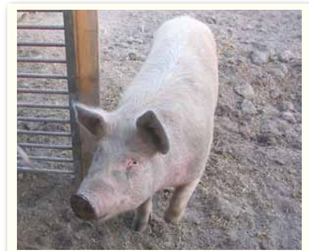
Turtle Valley, Chase, BC

The information and agreement models in this Guide are intended to help farmers, landowners, community organizations, land trusts and others understand what options they have when it comes to land access agreements. Each section can act as a stand-alone information source. This Guide focuses on two categories of agreements: long-term agreements (10-plus years), and shorter, “trial period” type agreements. The overall goal is to encourage agreements that give farmers tenure similar to that of owning the land and that integrate environmentally sustainable farm management practices.