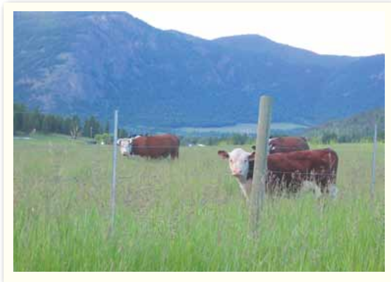
Turtle Valley, Chase, BC