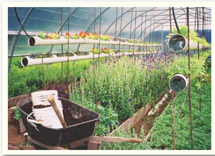
Fraser Common, Aldergrove, BC

Transferor: The person who owns the land and is offering a profit à prendre.