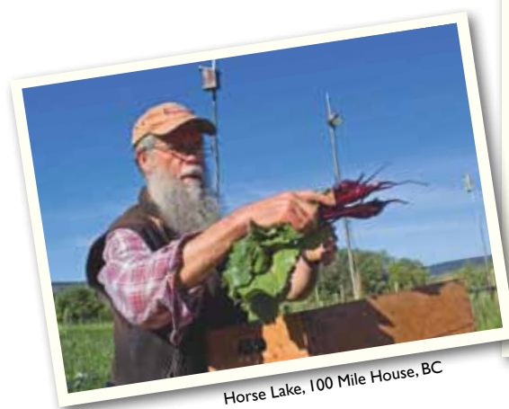
Horse Lake, 100 Mile House, BC

From a landowner perspective, a profit à prendre may decrease the value of the property if there are plans to on sell before the term of the profit à prendre expires.