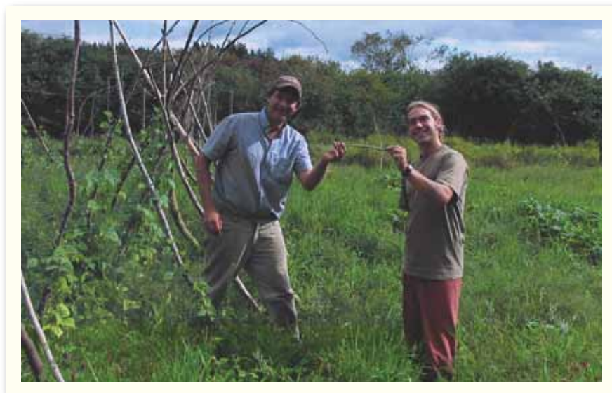
Lohbrunner Farm, Victoria, BC

Ideally, if a farmer wishes to use a house on leased property, the house should be leased under a separate agreement. If the farmland and the house on the land are leased in two separate agreements, the Commercial Tenancy Act applies to the land and the Residential Tenancy Act applies to the house. The farmer has greater tenancy protection under the Residential Tenancy Act than the Commercial Tenancy Act . The Commercial Tenancy Act is landlord oriented in its approach.