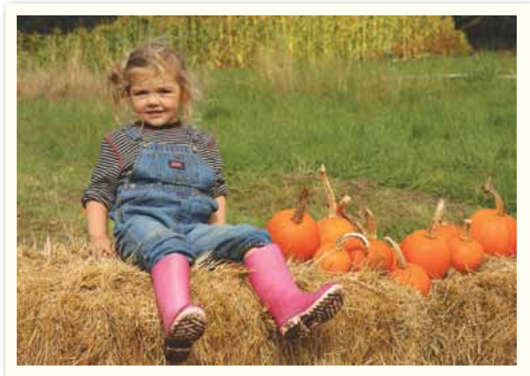
Madrona Farm, Victoria, BC

From a landowner perspective, a licence may not decrease the value of the property since the licence is not tied to the title of the land.