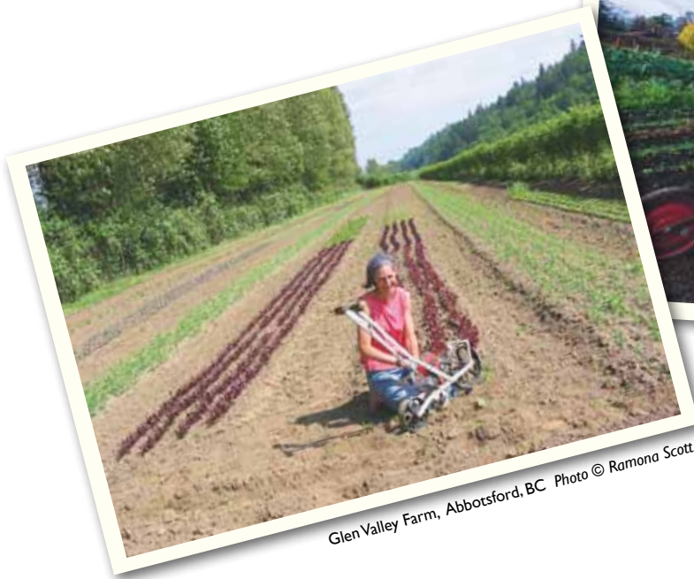
Glen Valley Farm, Abbotsford, BC

THIS GUIDE PROVIDES GENERAL INFORMATION ONLY. It is not legal advice. Please consult a lawyer when developing and signing any legal agreements.