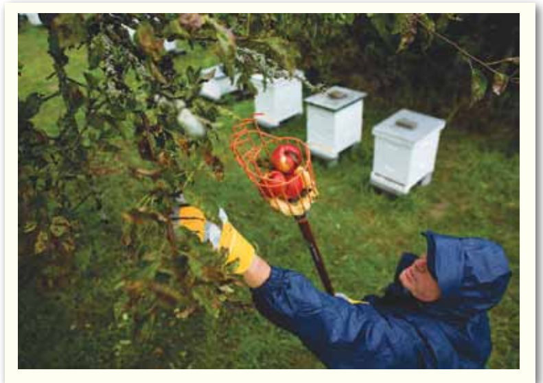
Keating Farm, Duncan, BC

Farmers and landowners entering into an agreement should fully investigate and address tax and insurance implications before signing. For example, the agreement may affect your capital gains exemption and/or your tax deferred rollover to children.