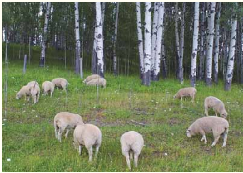
Horse Lake, 100 Mile House, BC

Micro-credit is another option for farmers who do not own the land they are farming. Farmers looking to finance a small business and having trouble getting credit from traditional sources may