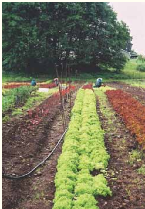
Fraser Common, Aldergrove, BC

It focuses on two general categories of agreements: long-term agreements (10 years or more) and short, trial period agreements. Additional information is provided on topics such as taxation, financing, and accounting for equity. 2