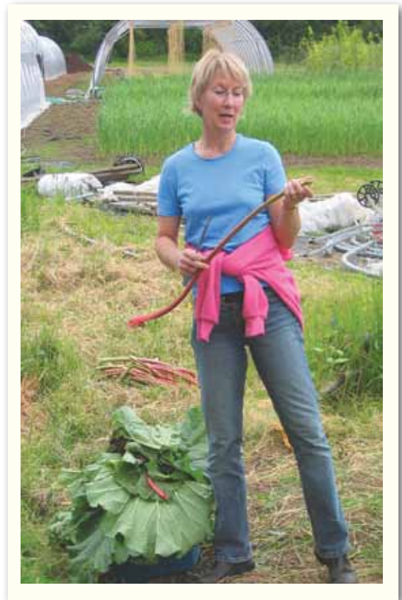
Nicomekl Farm, Langely Township, BC

It is not legal advice. Please consult a lawyer when developing and signing any legal agreements.