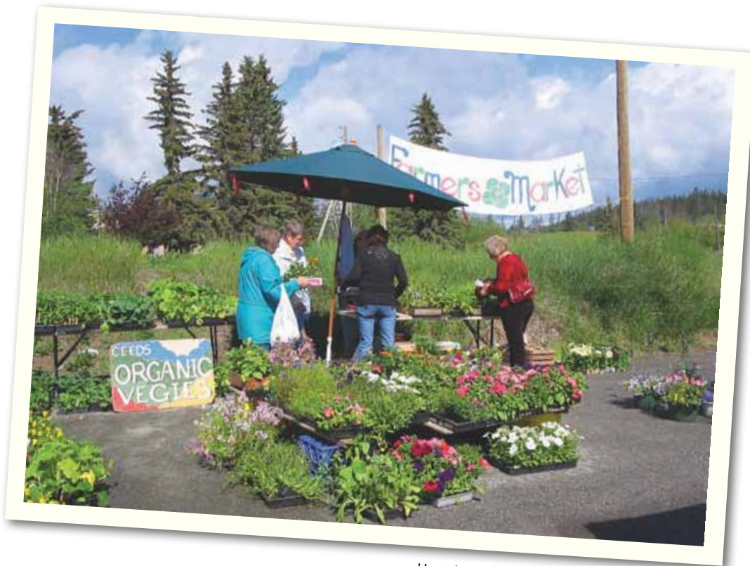
Horse Lake, 100 Mile House, BC

THIS GUIDE PROVIDES GENERAL INFORMATION ONLY. It is not legal advice. Please consult a lawyer when developing and signing any legal agreements.