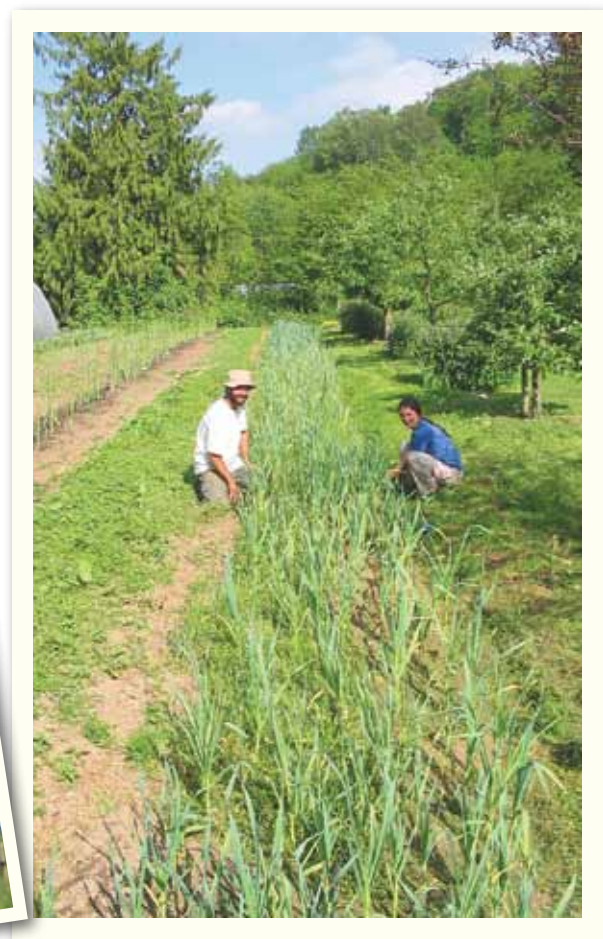
Glen Valley Farm, Abbotsford, BC