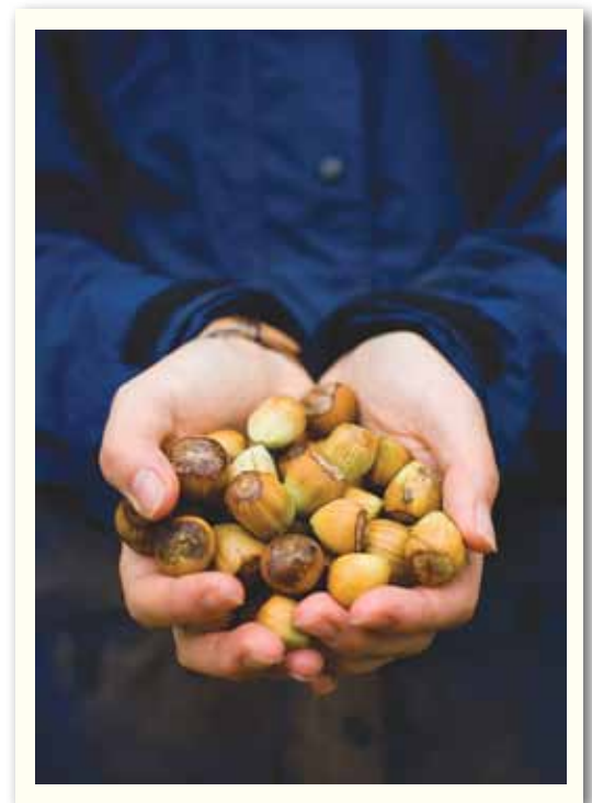
Keating Farm, Duncan, BC

The landowner must apply to BC Assessment for farm classification.