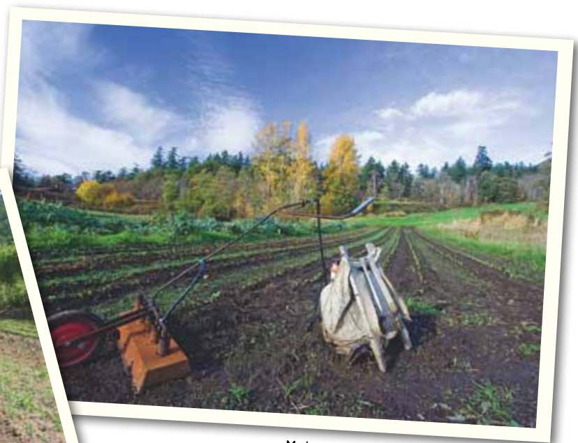
Madrona Farm, Victoria, BC