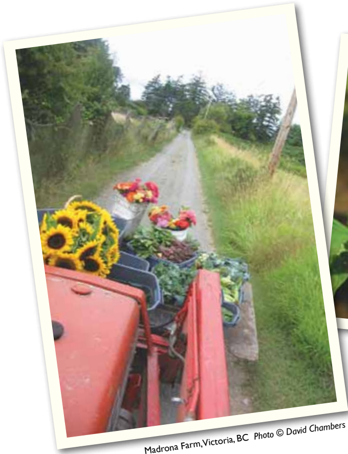
Madrona Farm, Victoria, BC

Farmland and associated housing leased under one agreement falls under the Commercial Tenancy Act , not the Residential Tenancy Act . According to the Residential Tenancy Act , section 4, it does not apply to: “living accommodation included with premises that (i) are primarily occupied for business purposes, and (ii) are rented under a single agreement.” The Act also does not apply to “(i) living accommodations rented under a tenancy agreement that has a term longer than 20 years.” If the land and the house on the land are leased in two separate agreements, the Commercial Tenancy Act applies to the land and the Residential Tenancy Act applies to the house. 29 It is in the farmers’ interest to lease the house separately as the Residential Tenancy Act provides stronger protection for tenants.